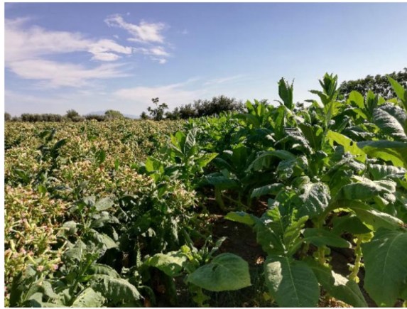
Figure 1. Nicotiana tabacum L. cv. Solaris (left) with reduced size and elevated number of flowers compared to traditional cultivar of smoking tobacco (right).

In order to limit the crisis affecting the tobacco sector in Italy, thanks to 15 years of research, a new cultivar of Nicotiana tabacum L. was developed for maximizing the production of seeds with high content of oil used as bio-fuel or biomass source 1 . This cultivar, named Solaris , is a non-GMO developed and patented as “energy tobacco” (PCT/IB/2007/053412) 3,4 , registered in 119 countries and granted in over 75 countries, including USA, all Africa, EuroAsia, Italy, Russia and Australia.