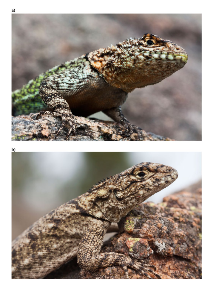
Figure 1. Male (a) and female (b) of Tropidurus spinulosus .