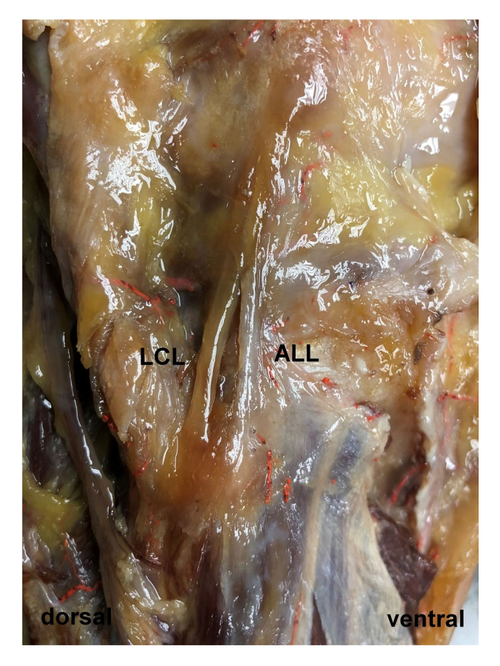
Figure 2. Specimen embalmed by use of Thiel's method<sup>32</sup> with dissected lateral collateral ligament (LCL) and anterolateral ligament (ALL).