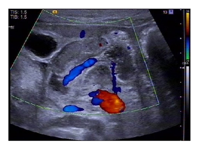
Figure 3. Doppler artifacts for examining the whole process of color blood flow passing through the Pylorus.