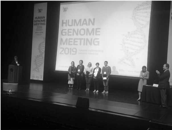
Fig. 2 Trainee awardees honored for their contributions at the HGM in Seoul