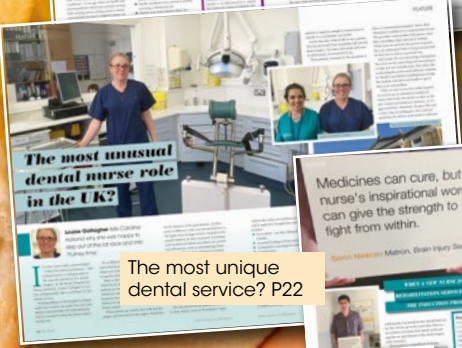
The most unique dental service? P22