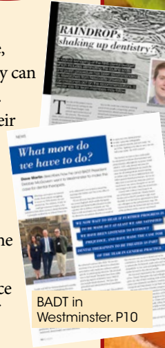
BADT in Westminster. P10