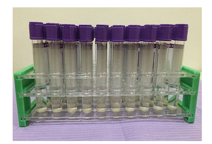
Fig. 2 Closed tubes containing specimens stored in distilled water. Composite specimens were stored in closed glass tubes with rubber stoppers and concave bottoms containing distilled water for 24 h before immersion in staining media. The specimens were kept inside the plastic tube holders.