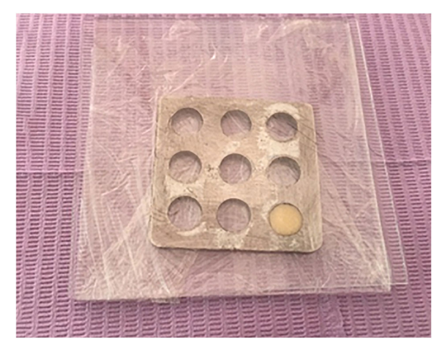
Fig. 1 Composite specimen preperation in a metalic mold between two glass slides and a nylon film. Each composite specimen was prepared separately in a metallic mold covered with a nylon film and held between two glass slides.