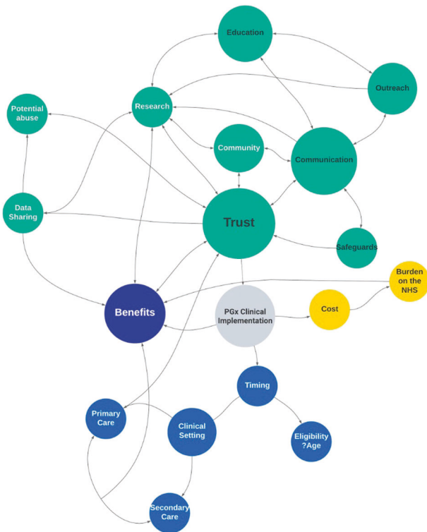
Fig. 1 Mind Map of focus group theme and sub-theme interactions. PGx Pharmacogenomics.

to support communication where language and literacy barriers are present: “GP can explain very well”.