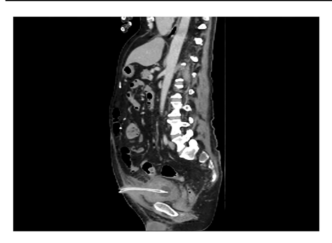
Fig. 1 Sagittal section of CT chest/abdomen/pelvis depicting invasion of malignancy into abdominal wall in Patient 1