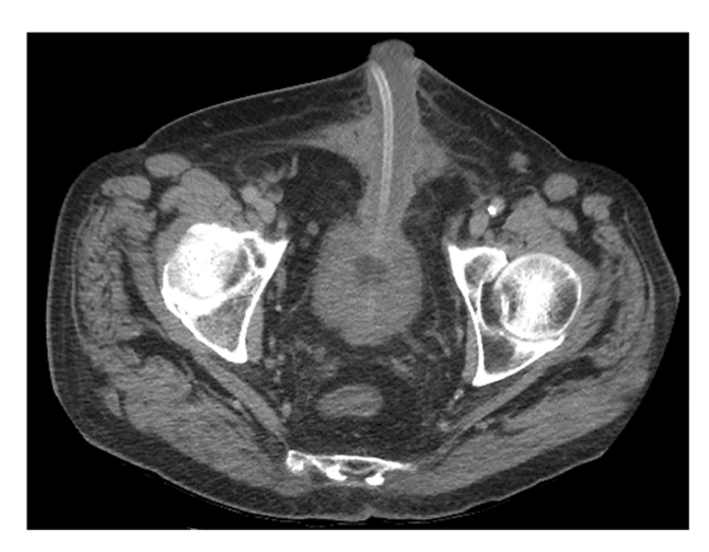
Fig. 4 CT scan for Patient 2 showing abnormal thickening of the SPC tract