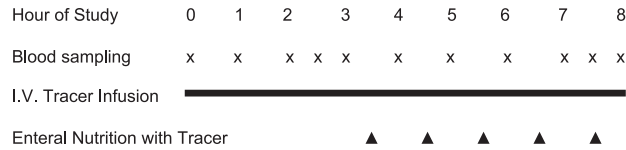
Figure 1. Schematic of the overall study design.

BMI, body mass index; CD, Crohn disease.