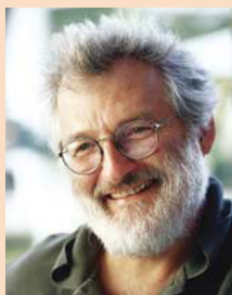
Sir John Sulston, former Director of the Wellcome Trust Sanger Institute

Sir John Sulston is the former director of the Wellcome Trust Sanger Institute in Hinxton, Cambridge, UK. He graduated from the University of Cambridge in 1963, and has worked mainly on the nematode worm Caenorhabditis elegans , but latterly has been involved with the sequencing of the human genome. Sulston is a Fellow of the Royal Society, and is an honorary fellow of Pembroke College, Cambridge. He shared the Nobel