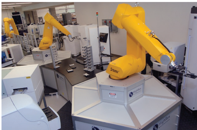
Conrad Prebys Center for Chemical Genomics at Sanford-Burnham Medical Research Institute