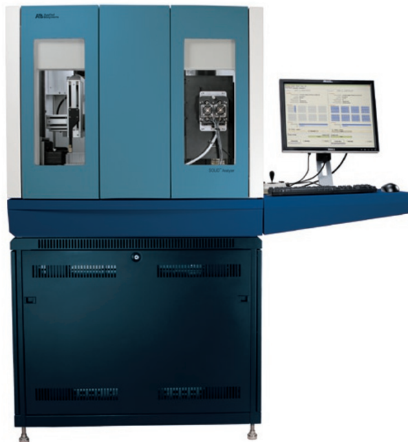
The SOLiD system from Applied Biosystems is an example of next-generation sequencing technology.

era of personal genomics (for additional discussion of technology behind personal genomics see the Technology Feature on personal genomics in the October 4, 2007 issue of Nature ). Church notes that this 1% of the genome might yield 98% of the information regarding positions that cause changes in traits.