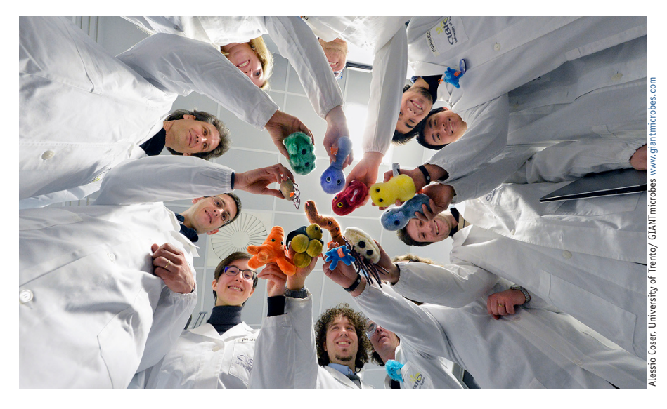
In the Segata group, one-third of the team does wet-lab work and the others are computational scientists focusing on biology.

computational scientists working on biological problems. He integrates the group for discussions and tool testing. A different kind of integration—tool integration—will, Segata hopes, begin in the metagenomics community. Integration means, for example, having on hand data standards for tool input and output. But such standards are hard to establish in a rapidly changing field, and, he says, grant funders sometimes do not view tool-integration projects as favorably as projects about new tools.