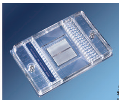
Fluidigm Corporation's BioMark HD System for digital PCR and qPCR.