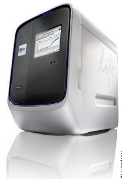
Life Technologies' QuantStudio System for digital PCR and qPCR.

we found is that a lot of our customers want the capability [for digital PCR] but aren't ready to jump in and say that that's the only thing that they have to do," says Pickering. Buying a machine that can do both, he says, is similar to the decision to purchase a hybrid gas and electric automobile rather than an electric-only vehicle.