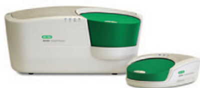
Bio-Rad's QX100 droplet digital PCR System.

Another digital PCR system has been developed by RainDance and is scheduled to launch later this year. The machines in