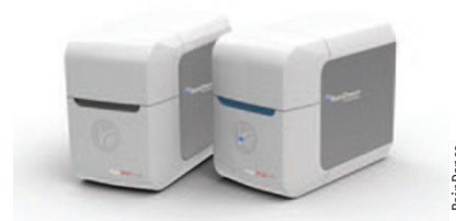
RainDrop Source and RainDrop Sense machines for droplet digital PCR.