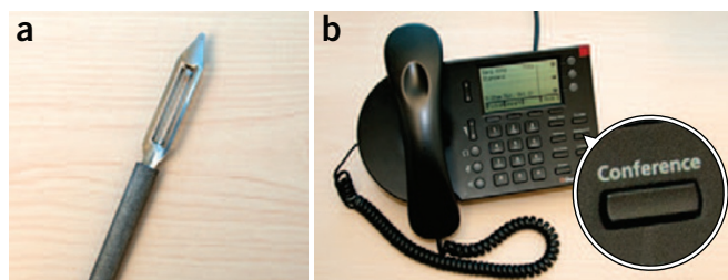
Figure 1 | Visual clues should communicate a product’s functions and features. (a) A vegetable peeler with easily interpretable function. (b) An office phone with poor visual cues to indicate its operation.

It might be helpful to think of scientific presentations as products that should perform a function. For example, a subway map is a highly efficient tool for figuring out how to get from one part of a city to another. If the train information were presented in a table of stops and connections, the job of finding the shortest route between two points would still be possible but much more difficult. When designing scientific figures, it helps to develop a well-organized approach