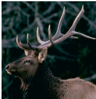
CWD could be on the rise.