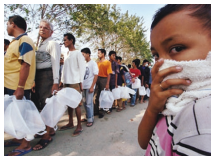
Temporary patch: Permanent clean water may be neglected in aid efforts.

While welcoming these efforts, local experts say that they are only a short-term patch against infectious disease. Authorities would have a far greater impact on public health, they say, if they spent some of the aid money fortifying fragile public health infrastructure. This could be done by creating permanent clean drinking water supplies, improving sanitation and building up clinics, diagnostic equipment and drugs.