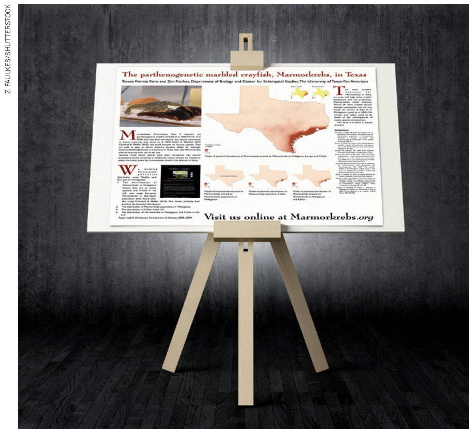
A winning poster uses bold graphics, plenty of white space and limited text to draw viewers.

NATUREJOBS For the latest career listings and advice www.naturejobs.com