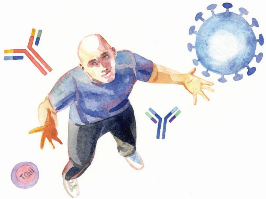
A successful HIV vaccine will probably juggle broadly neutralizing antibodies with strong T cell responses to achieve efficacy.

Alongside the B cell approaches described above, a strategy is needed to make vaccines