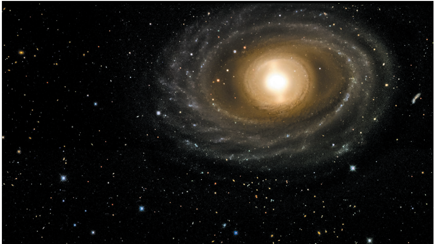
The Dark Energy Survey mapped the shape of 26 million galaxies, including NGC 1398, which is about 20 million parsecs from Earth.