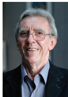
Molecular architects: Fraser Stoddart, Bernard Feringa and Jean-Pierre Sauvage.