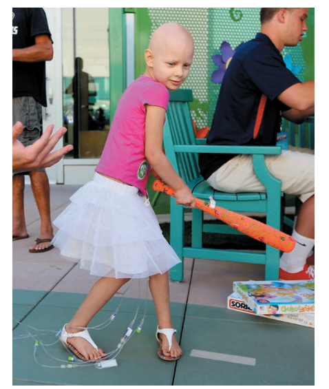
Childhood cancer is a high priority for experts.

The advisory panel — whose members include leading cancer researchers, physicians and patient advocates — also called for new technologies, including advanced imaging techniques and drug-delivery devices; a focus on proteins that drive many paediatric cancers; and studies of how tumours