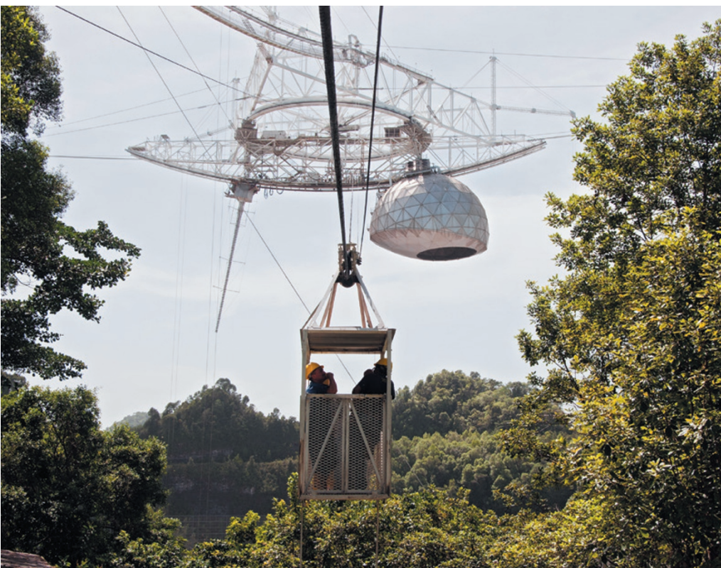
The Arecibo Observatory in Puerto Rico is beset by budget problems.

to build and operate new telescopes that are high priorities for the astronomy community, such as the Large Synoptic Survey Telescope now under construction in Chile. In 2006, an expert panel recommended that the agency close Arecibo unless someone else could be found to foot the bill. NASA began kicking in with money five years ago and now contributes $3.7 million annually, but so far no one has materialized to pay the rest.