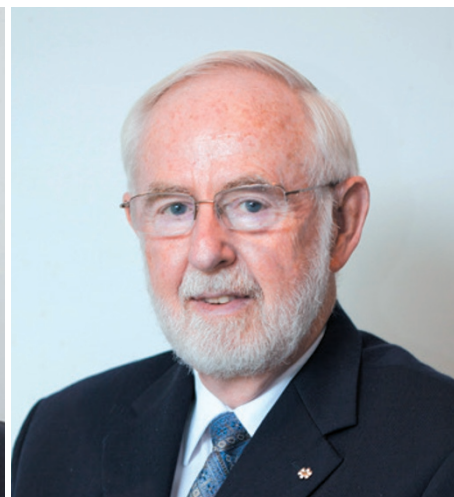
Takaaki Kajita and Arthur McDonald share the 2015 Nobel Prize in Physics.

electron-type neutrinos streaming from the Sun than theorists had predicted. (Alongside Masatoshi Koshihara of the University of Tokyo, Raymond Davis, who led the Homestake experiment, later shared half of the 2002 Nobel Prize in Physics for developing techniques to detect such neutrinos from space.)