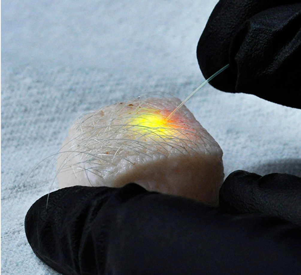
Matjaž Humar/Seok Hyun Yun

An optical fibre is shown activating tiny lasers created within pig skin cells.