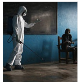
Nature special: Ebola outbreak in West Africa

I think the world is becoming aware that issues like this are not going to go away. The developed countries of the world will have to do our part to assist our colleagues with less-developed infrastructure to care for sick people. I think one of the messages that is going out from many sources is we really have to help countries such as the ones involved in this outbreak to develop their medical infrastructure. Hopefully in five years they will have this infrastructure.