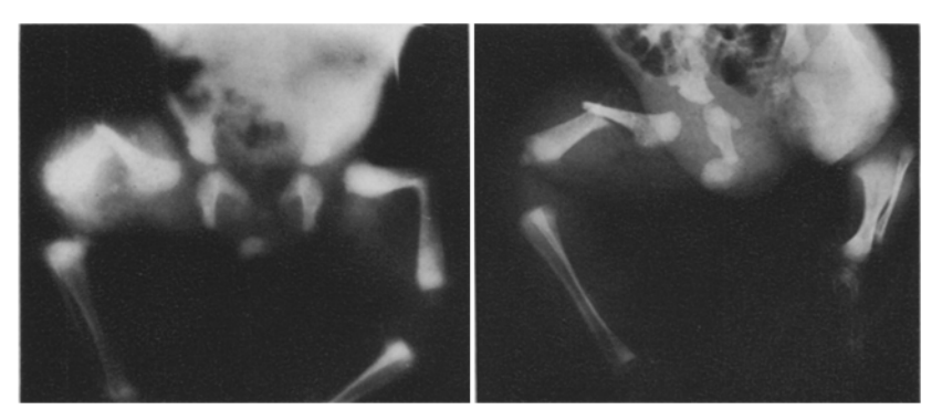
Fig. 4. Bowing of the femurs, which are hypoplastic, with fracture. Left, patient 1; right, patient 2.

aplastic fingers and toes, hypoplastic dermal patterns, and hypoplastic labia majora (Fig. 1, left).