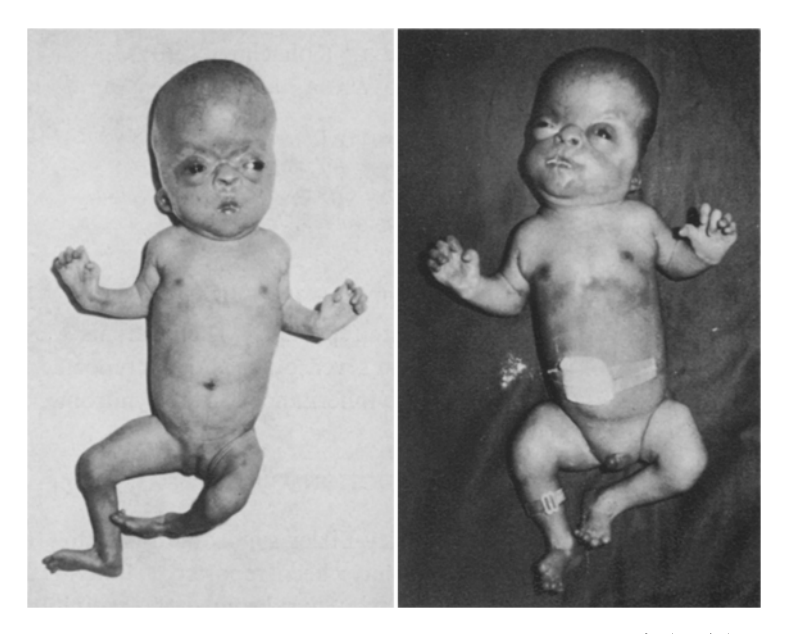
Fig. 1. Photographs of the siblings. Left, patient 1 on the 10th day of life; right, patient 2 on the 3rd of life.

frontal bossing, a large anterior fontanel, sparse hair, midface hypoplasia, a depressed nasal bridge with a bulging tip, choanal stenosis, a long philtrum, a small mouth, a high and narrow palate with a posterior cleft, and dysplastic and low set ears with stenotic external auditory canals. Anomalies of her limbs included contractures of the elbows, wrists, knees and fingers, arachnodactyly, syndactyly, hypoplastic and