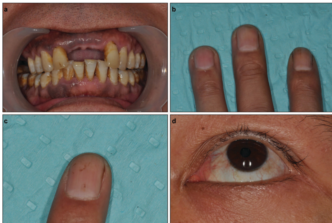
Figure 3 Clinical photographs in case 2. Extensively diffuse pigmentation distributed over the upper and lower gums (a). A single longitudinal pigmented band or multiple longitudinal pigmented bands were present on parts of the fingernails (b). There was irregular or stippled pigmentation on the nail of index finger (c). An ill-defined 3 mm×2 mm brown macule was noted in the inferior temporal quadrant of the left conjunctiva (d).