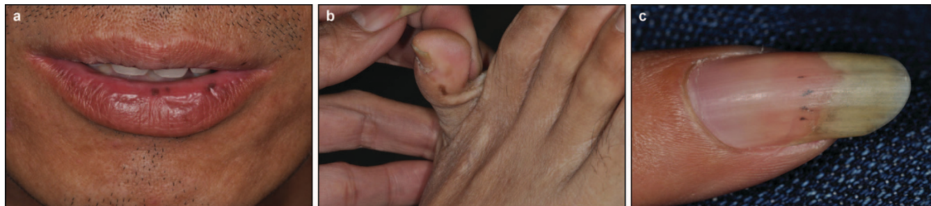
Figure 4 Clinical photographs in case 3. Multiple, round- to ovoid-shaped, blackish macules were present on his lips (a). A brownish macule was observed on the interdigital area of the left little toe (b). Some irregularly shaped or stippled pigmentation was noted on parts of his fingernails (c).