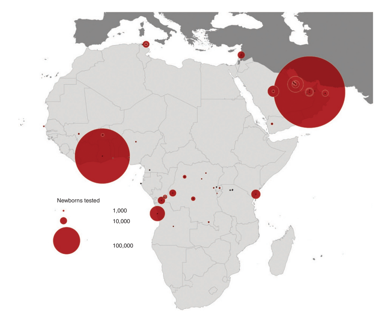
Figure 1 Distribution and size of newborn screening surveys of hemoglobin S and hemoglobin C in Africa and the Middle East.

PIEL et al. | Hardy-Weinberg deviations in newborn screening surveys of Hb variants in Africa and the Middle East