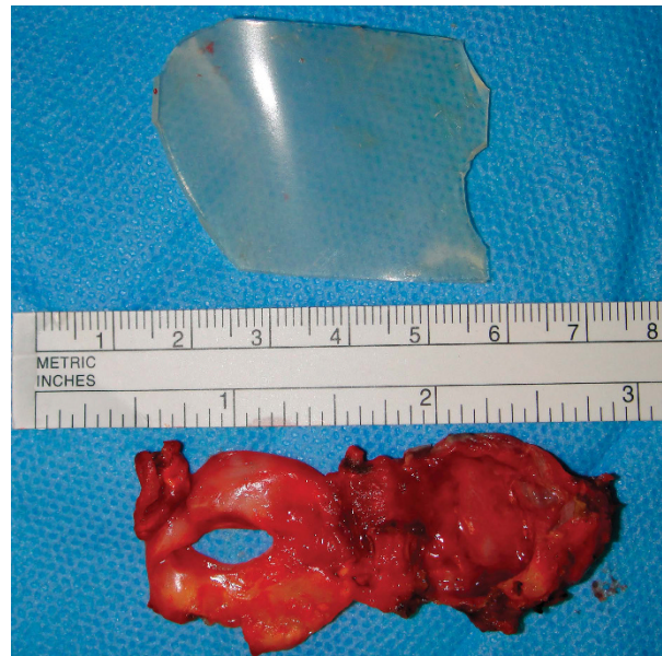
Figure 1 Excised fibrous cyst and silicone sheet removed from an area of orbital roof repair performed 23 years before (Patient 11; Table 1).

Twenty-three patients (13 male; 57%) presented at a median age of 46 years (mean 45.3; range 14–76 years), with the interval between previous surgery and presentation ranging from 1 to 50 years (median 25 years). Five had undergone ocular removal (with ball implantation in 4), six had orbital fracture repair with a silicone or titanium implant, eight had a history of prior strabismus surgery, three had retinal detachment repair (either a scleral buckle or vitrectomy) and a single patient had required repair of a conjunctival laceration during childhood. All except one patient underwent either marsupialisation or complete excision of the implantation cyst, with no record of recurrence at up to 56 months follow-up (mean 14, median 24, range 3–56 months). All cysts had a fibrotic wall of variable thickness, with most showing mucin-secreting conjunctival epithelium or, more rarely, pseudostratified