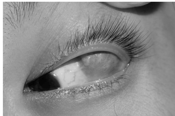
Figure 2 Patient presenting with a large orbital conjunctival inclusion cyst overlying the lateral rectus insertion at 25 years after strabismus surgery (Patient 12; Table 1).

ciliated respiratory epithelium (Table 1). The visual acuity changed in a half (11/22) of the patients undergoing surgery, this always being an improvement (Figure 3).