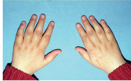
Figure 3 The hands of the child shown in Figure 4a. The digits are generally fusiform in shape and the terminal phalanges somewhat hypoplastic.