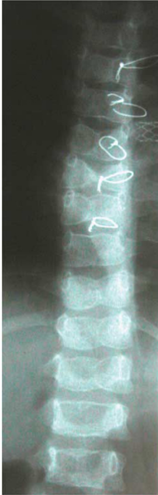
Figure 2 Butterfly vertebrae seen in the thoracic and upper lumbar regions. The child had undergone cardiac surgery, hence the presence of visible wires.