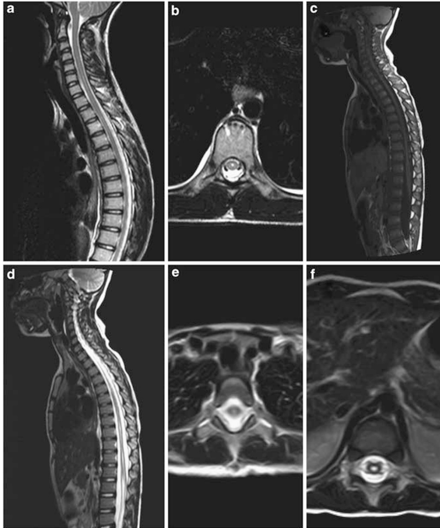
Figure 2 MRI findings. (a) and (b) Patient 2 with deletion 16p11.2, (c–f) patient 3 with duplication 16p11.2. (a) Sagittal T2-w imaging of the spine of patient 2 showing dilated central canal extending from C5–T10. No Chiari malformation, low tethered cord, thickened fatty filum, or other dysraphic features were demonstrated. (b) Axial T2-w images demonstrate maximal dilation of the central canal opposite T8. (c) Sagittal T1-w image of patient 3 demonstrating syrinx extending from the cervicothoracic junction down to the conus. No associated Chiari I or other dysraphic features. (d) Sagittal T2-w image confirming extensive syrinx most marked at the thoracolumbar junction, where it returns T2 bright signal. (e) Axial T2-w image at the level of the cervicothoracic junction demonstrating dilatation of the central canal. (f) Axial T1-w image demonstrating maximal dilatation of the extensive syrinx opposite the T12–L1 level. The conus terminates in a normal location and no thickened fatty filum or intrathecal lipoma is observed.

using the Puregene DNA extraction kit (Gentra, Minneapolis, MN, USA) according to the manufacturer's instructions. The study was approved by the Institutional Review Board of BCM, and all participants or parental guardians were recruited after informed consent was obtained. Photographs of the patients were collected after obtaining informed consent for publication of the photographs in the medical literature.