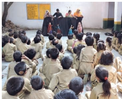
Training workshops for scientists and creative public engagement programs are central to India Alliance's vision of building a robust biomedical research ecosystem in India. Top image represents hematopoietic stem cells (purple), progenitor cells (blue), niche cells (green) and cardioblasts (orange) in a Fruit fly.