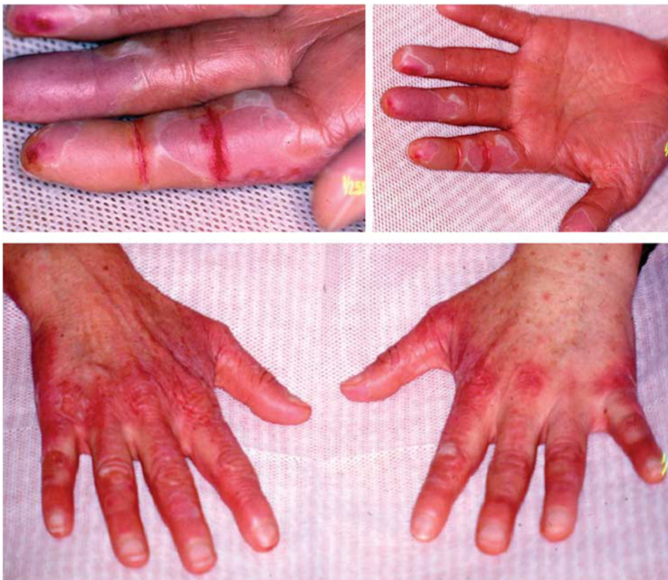
Figure 2 Photographs of grade 4 palmo-plantar erythrodysesthesia.