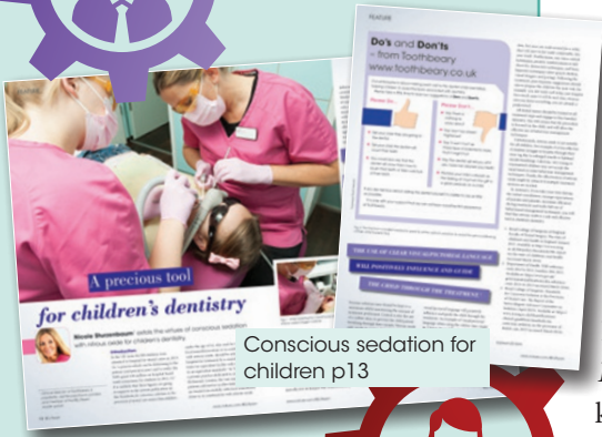
Conscious sedation for children p13