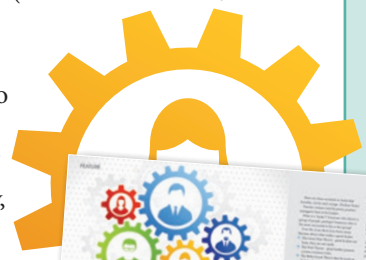
Managing employees p21