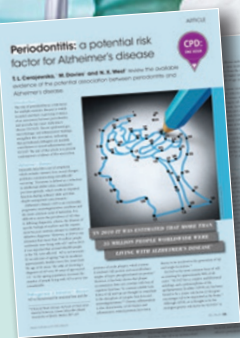
Periodontitis & alzheimer's p6