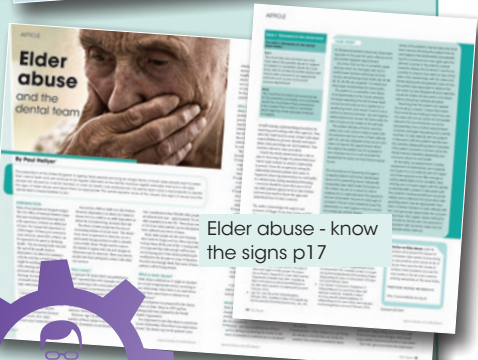
Elder abuse - know the signs p17