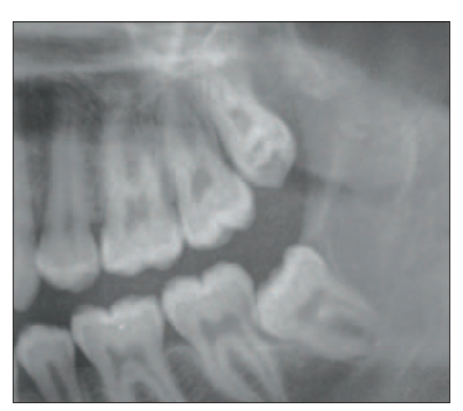
Fig. 1 Dental panoramic radiograph

teeth, complaining of frequent episodes of infection, swelling and irritation associated with an erupted maxillary third molar. Although clinical examination clearly revealed double teeth, radiographic examination failed to accurately demonstrate the anomalous tooth morphology (Fig. 1). The extracted tooth had five separate roots (Figs 2a-c).