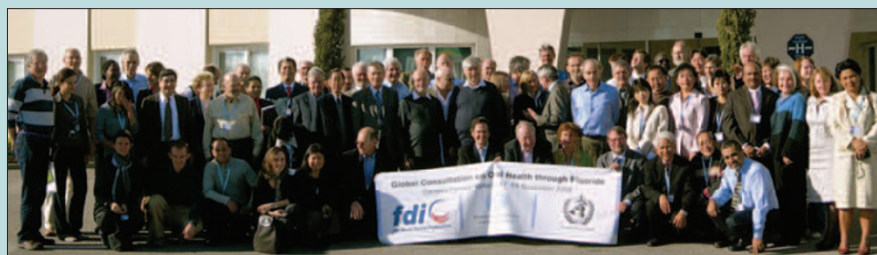
The consultation group in Geneva.

A panel of experts on fluoride has urged governments and other influential bodies to develop effective legislation, necessary directives and programmes to ensure access to fluoride for dental health in all countries.