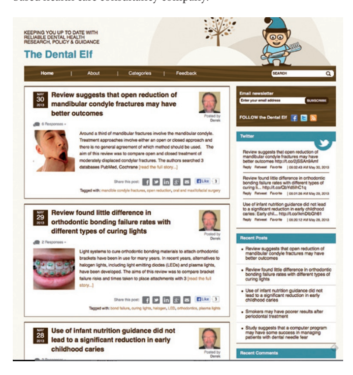
New Dental Elf Home page

The development of the National Elf Service is being led by Minervation Ltd., (http://www.minervation.com/) an evidence-based health care consultancy company.