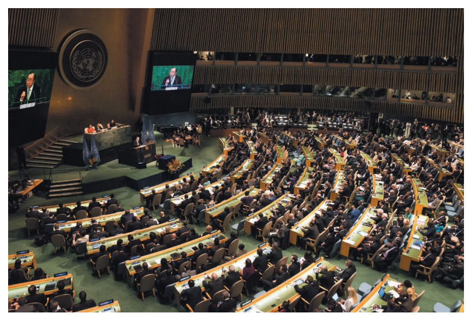
The United Nations General Assembly: collective decision-making in action.

To learn more about how groups use our software, we carried out a trial (see 'Prioritization pilot'). We compared some common voting methods to see whether the resulting recommendations differed (they