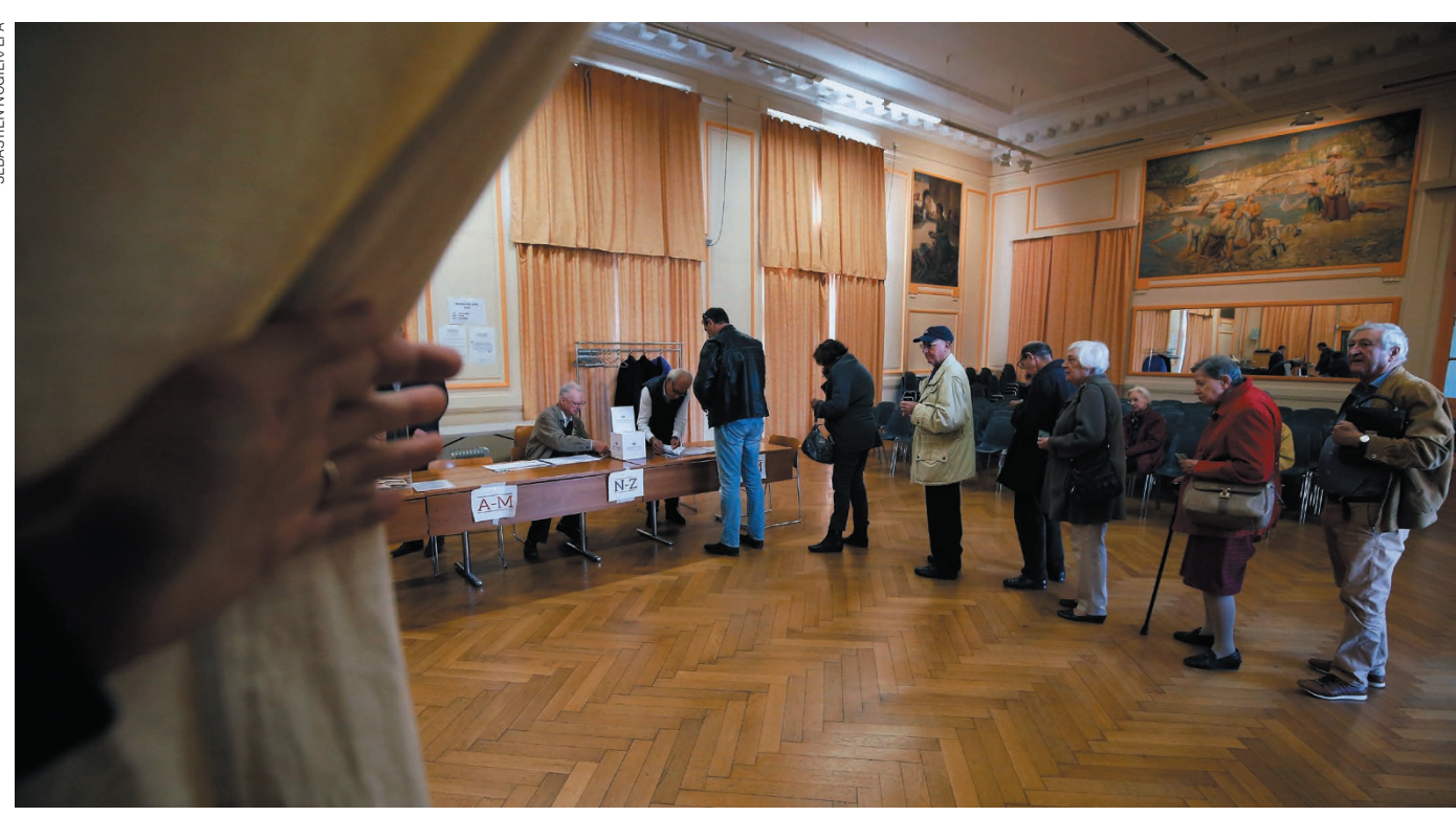
Citizens cast votes in a second-round primary of the 2017 French presidential election.

ENERGY Natural gas could help Germany transition to electric cars p.157