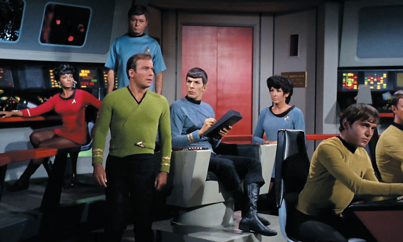
The original crew of the USS Enterprise .