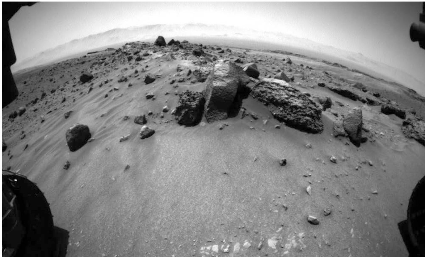
View from the Mars rover Curiosity at the foot of Aeolis Mons, before the rover starts to climb the mountain.