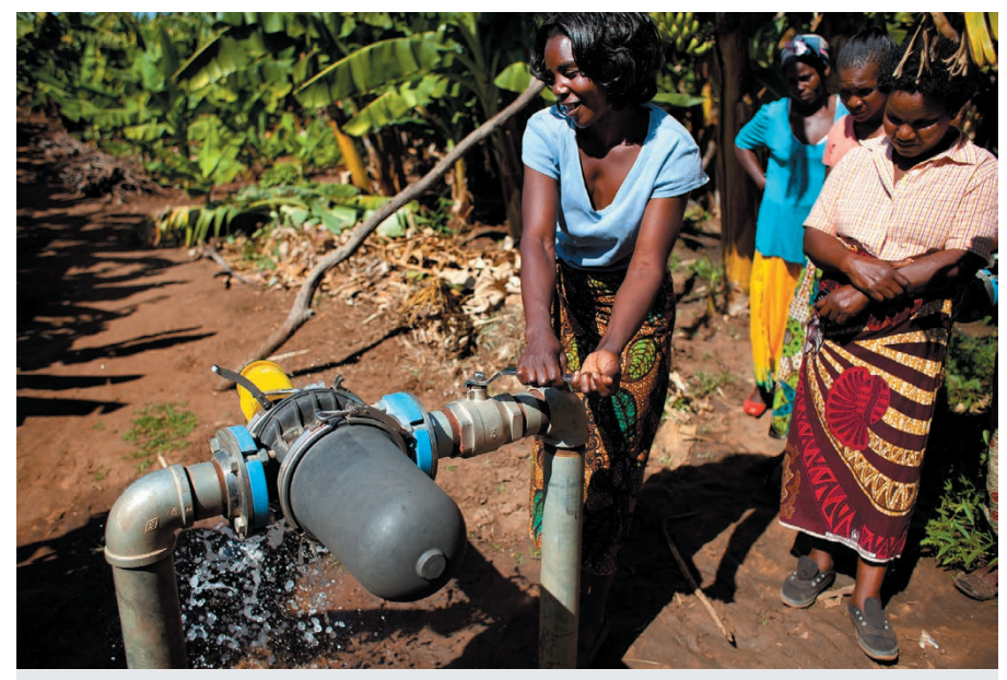
A hydropowered irrigation pump in use at the Kabwadu Women's Banana Farm in Zambia.