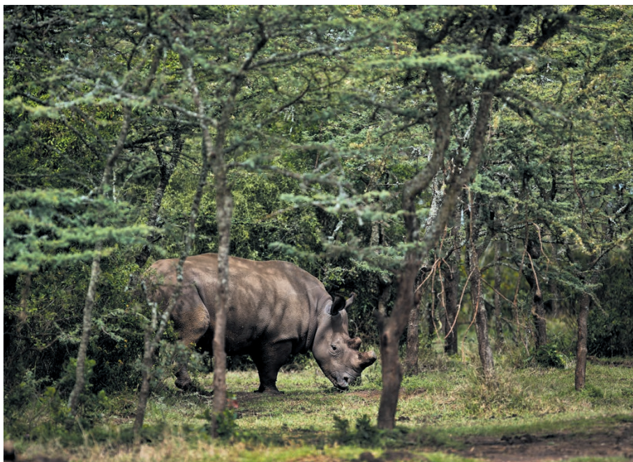
Fatu is one of three remaining northern white rhinos, all of which live in Kenya's Ol Pejeta Conservancy.