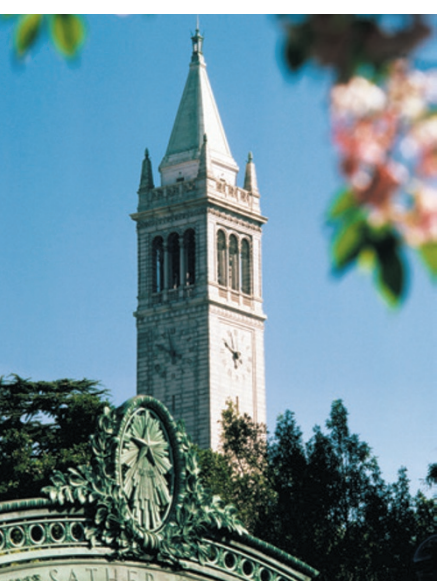
The Broad Institute of MIT and Harvard (left) and the University of California, Berkeley (right).

its state funding cut by $48 million in 2012 — holds a substantial number of patents that have not yet been licensed and has a famously low ratio of patent-licence revenue to research expenditure<sup>7</sup>. If its financial situation were to deteriorate further, the university might be compelled to extract licence fees from other research institutions for those patents.