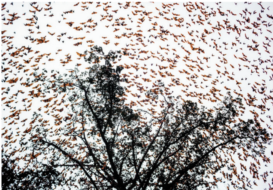
Bats are suspected to be a wild reservoir of the Ebola virus.