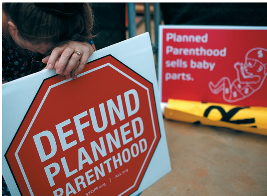
The collection of aborted fetal tissue for use in research has prompted demonstrations for and against US health provider Planned Parenthood.

number of eye diseases, including age-related macular degeneration, the most common cause of blindness in adults in the developed world. The 2000s saw advances in ways to create cell cultures with RPE dissected from the eyes of fetuses, allowing scientists to study the function of these cells in a dish. And although some scientists have turned to stem cells to generate RPE, like Goldstein they continue to use fetal tissue as a benchmark of normal development and function.