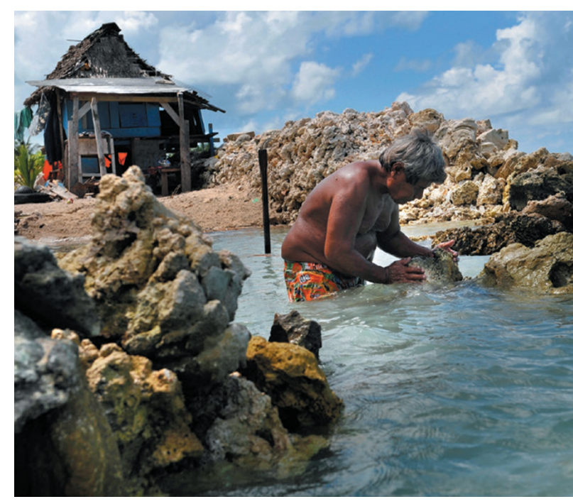
A man rebuilds the sea wall that protects his home on South Tarawa.

He also believes that most scientists make a mistake by tethering the fate of atoll islands to the health of surrounding coral reefs. Even if reefs