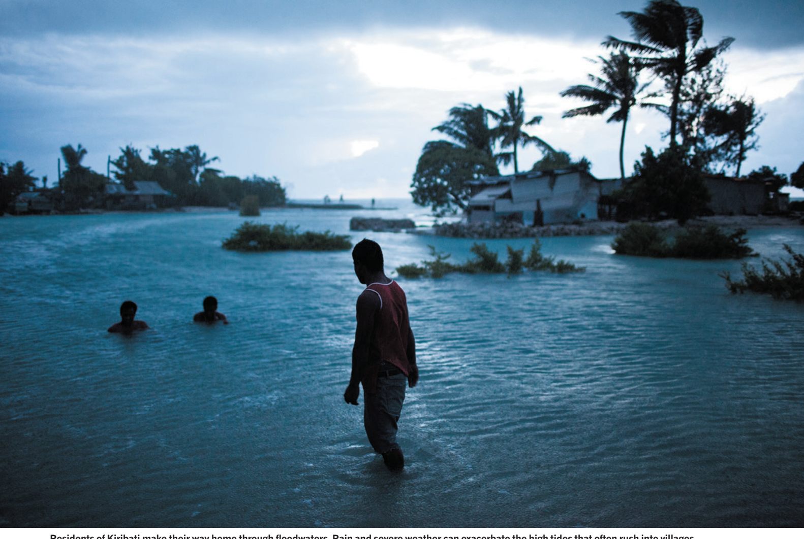
Residents of Kiribati make their way home through floodwaters. Rain and severe weather can exacerbate the high tides that often rush into villages.