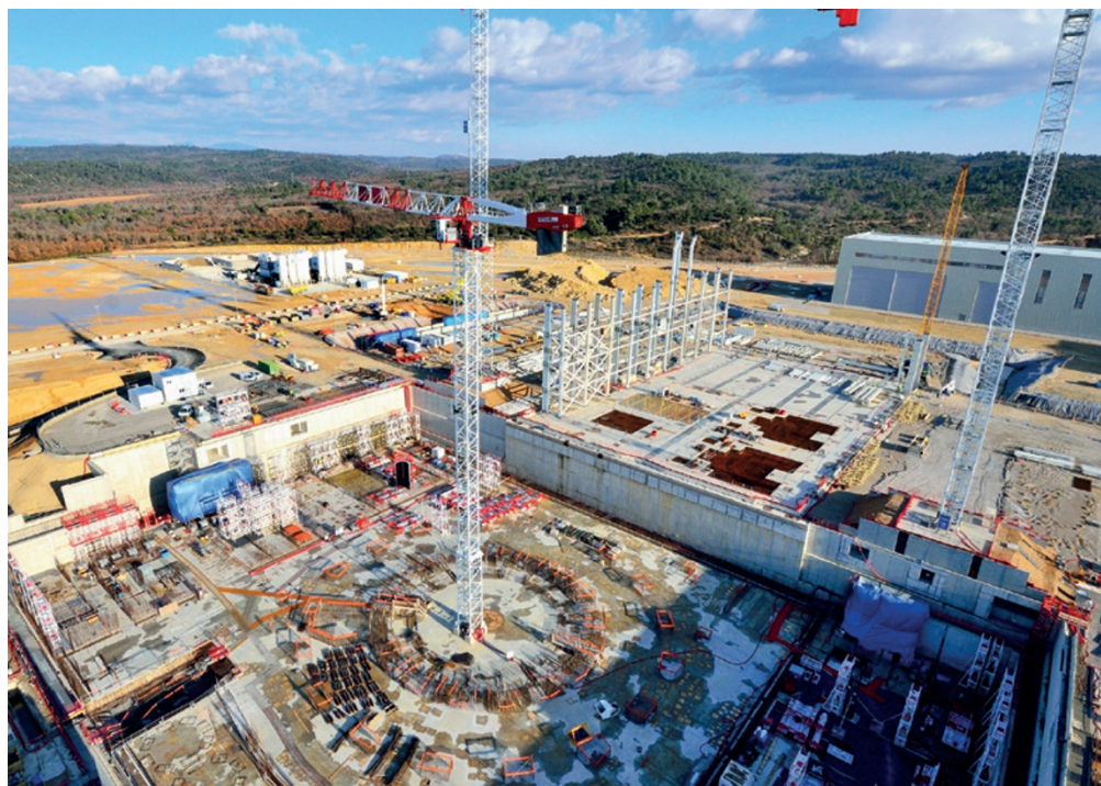
Construction at St-Paul-lez-Durance, France, site of the ITER nuclear-fusion experiment.

In my experience of industrial projects, a reserve fund must comprise about 20% of