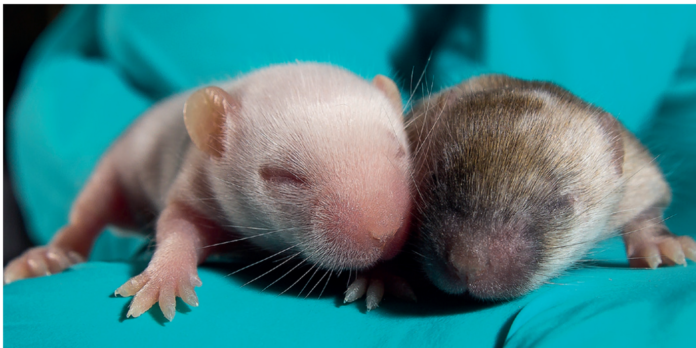
Littermates are often a mixture of mice carrying a required mutation and 'wild type'.

of microbes residing in the gut), which can vary for mice at different institutions even when they are fed identical diets, also causes surprising differences. Repositories are beginning to use DNA sequencing to define common variables such as diet, housing and other factors that may modulate microbiota 3 . This could reveal the effects of these variables on a variety of mouse traits, and make animal studies conducted by collaborating investigators more efficient and reproducible.