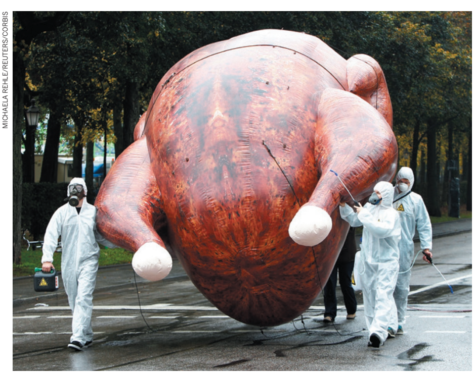
Activists campaign against a trade treaty that they fear will allow US chlorine-washed chicken into the EU.

DEFENCE Laser weapons go from science fiction to battlefield fact p.408